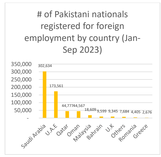
Figure 1: Number of Pakistani nationals registered for foreign employment by country (January-September 2023)