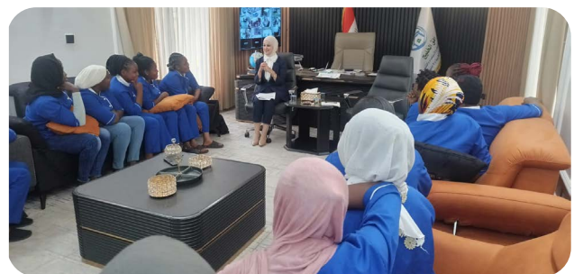
MRC counsellor delivering PAOS to female migrant workers in Iraq