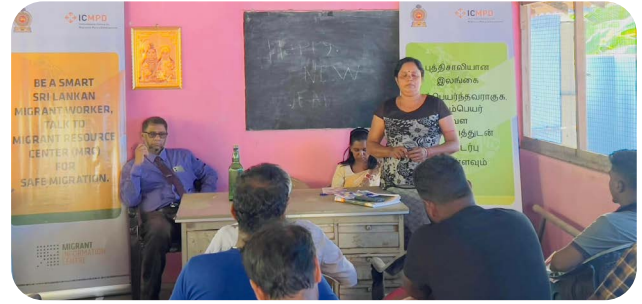
MRC Sri Lanka outreach