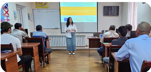
Group counselling by MRC Tajikistan at the Pre-departure centre of Migration Service

MRCs offer a wide range of services to migrants seeking regular and legal migration pathways. These services often include providing information and guidance on legal migration options, assisting with visa applications, offering legal advice and support, facilitating language and cultural orientation programs, and referring migrants to other support services