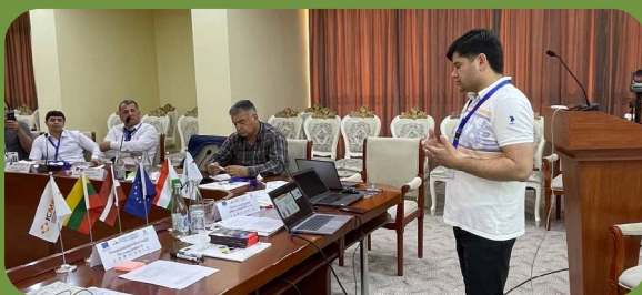
Outreach session in Khujand with the staff of MoLMEP

In November 2023, MRC in Tajikistan reopened in the premises of Migration Service in Dushanbe. The MRC in Dushanbe works closely with individuals interested in migration and provides accurate and timely information to potential migrants to enable them to make informed decision on their migration plan. The MRC is fully engaged in the provision of counselling and pre-departure preparations with potential migrants on a plethora of themes such as seasonal work in the UK, new amendments in the law of Russia on migration, response to the recent terrorist attack in Moscow, Private Employment Agencies – actives ones and the ones in black list, preparation for recruitment to South Korea through Employment Permit System (EPS), extremism and terrorism, human trafficking, benefits of organised recruitment overseas, etc.