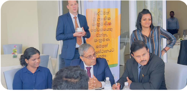
MRC Strategic Planning workshop in Colombo