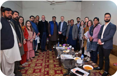
EU Delegation visit to Gujrat