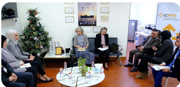
Visit of Ambassador of Finland to the MRC Baghdad