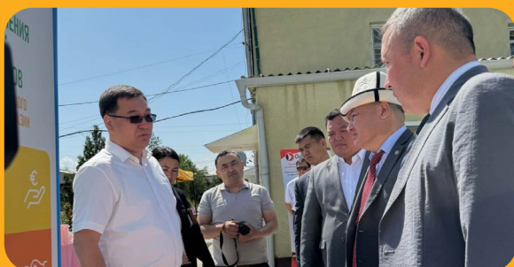
Outreach sessions in Batken, Kyrgyzstan

As part of community outreach activities in the Jalal-Abad and Batken regions, the MRC and the Centre for Employment of Citizens Abroad conducted meetings with district state administrations, municipalities, universities, officials from the district and city departments of the Ministry of Labour, Social Security, and Migration of the Kyrgyz Republic, representatives of rural authorities, social workers, youth, and district police officers. The discussions focused on safe and regular labour migration and the risks of illegal migration. Participants actively asked questions, highlighting the lack of such information and the importance of these meetings.