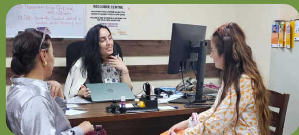
Special counselling for women in the MRC Tajikistan