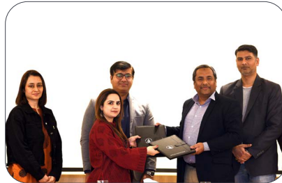
MoU signing between MRC Pakistan and UCP